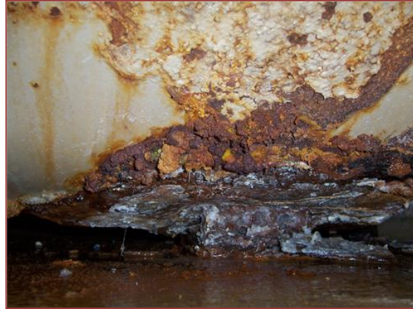
Corroded tanks at Idlewild Pool

For more information regarding the Recreation Facilities Plan or to be advised of future public meetings contact 334-6265.