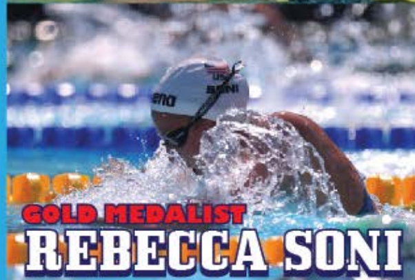
GOLD MEDALIST REBECCA SONI